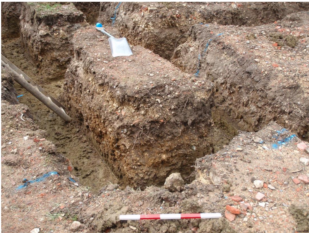
Plate 3. Foundation trench (looking NE)