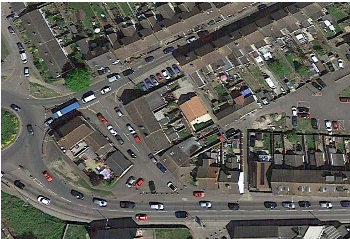
AP 1. View of proposed development area (2018)