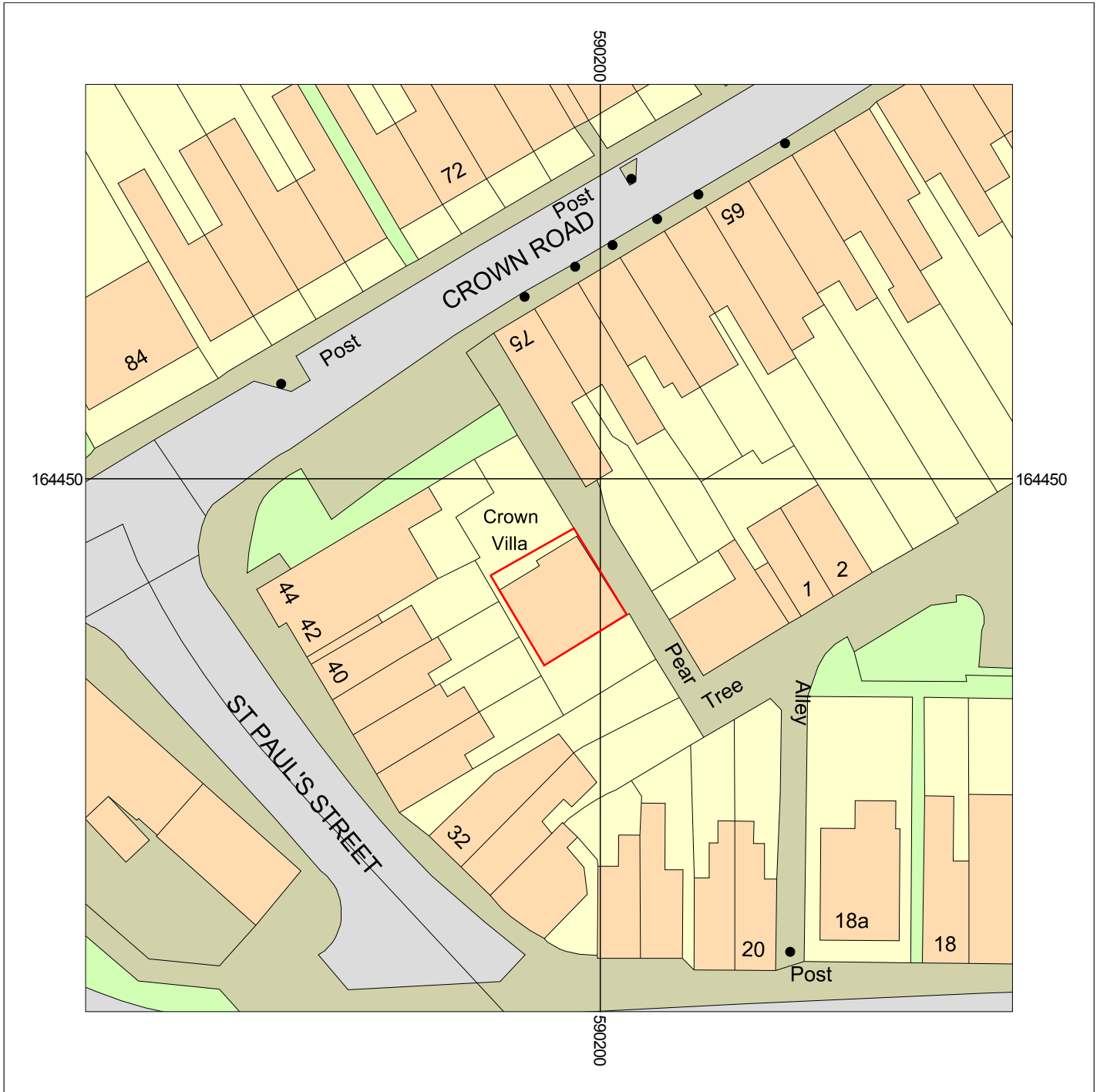
Figure 1. Area watched