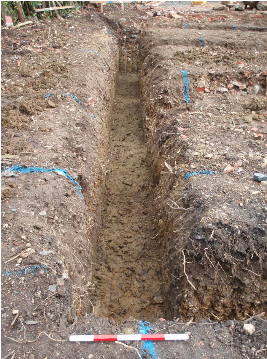
Plate 4. Foundation trench (looking NW)