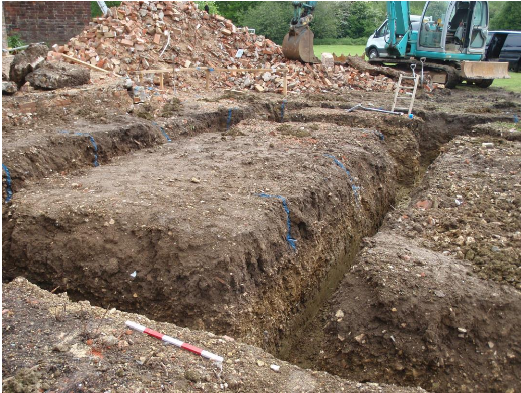
Plate 2. View of foundation trenches (looking NE)