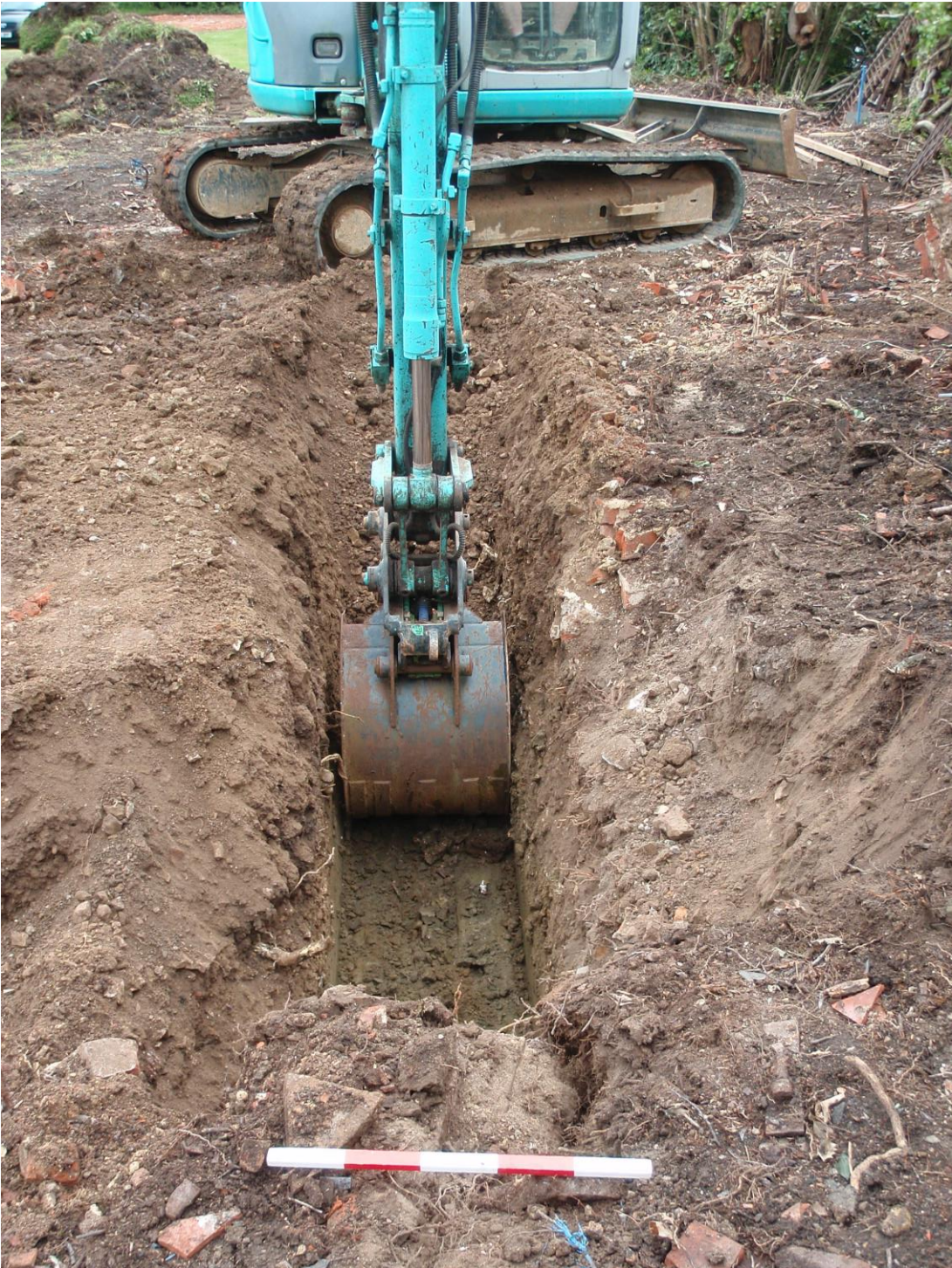
Plate 1. View of the foundation trenches (looking SW)